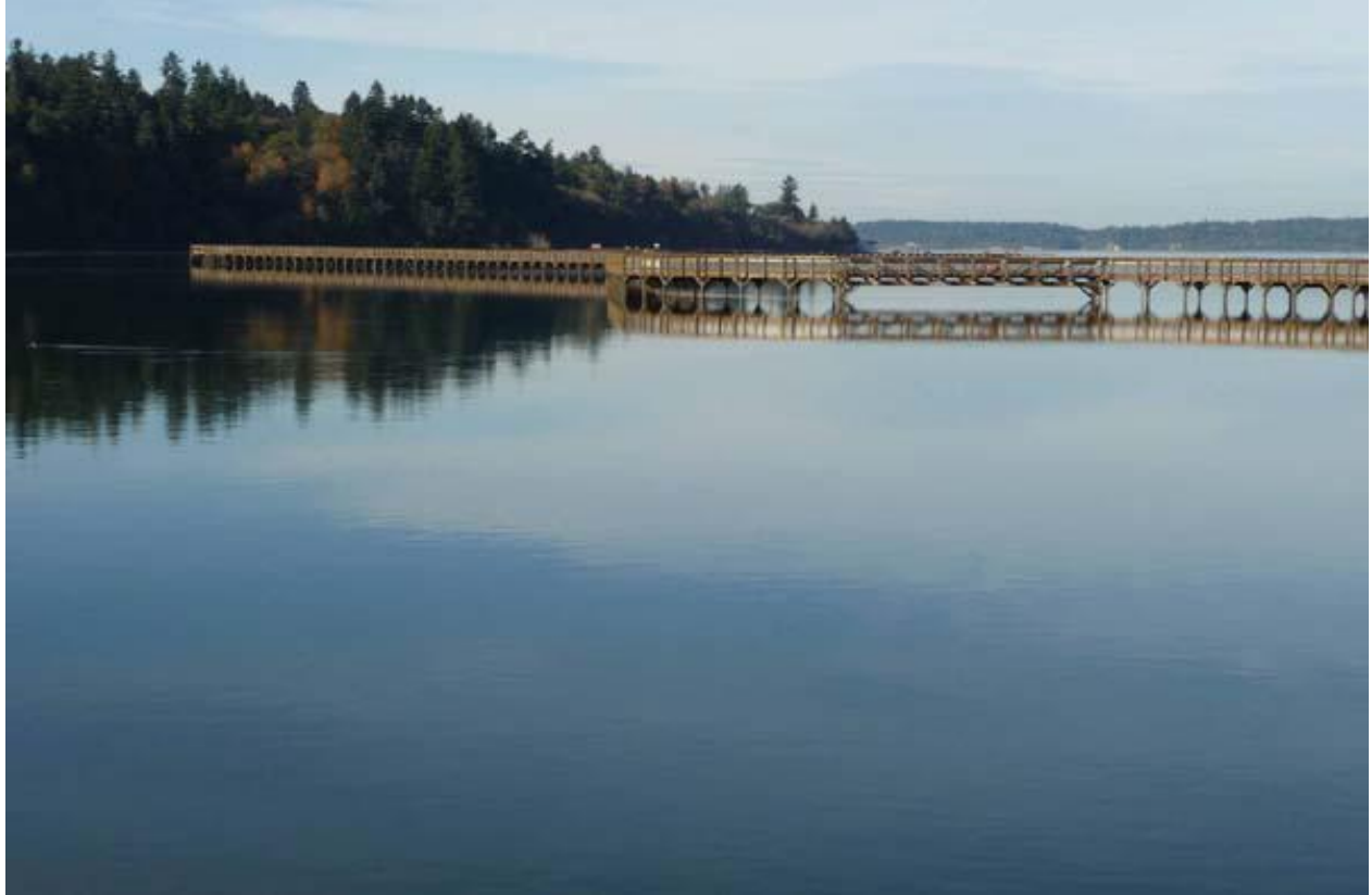
The Nisqually Estuary Boardwalk Trail